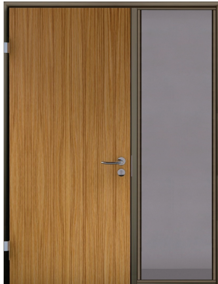
Side part with special hinge

All illustrations with tube glazing beads (standard, butt jointed)